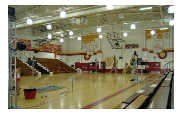
Poor ventilation in gym needs to be addressed.