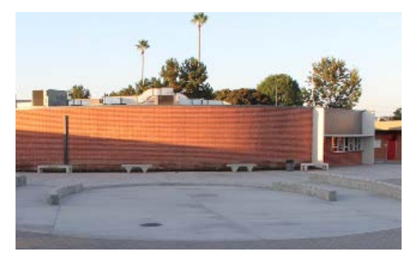
Loara Theater in need of upgrades.