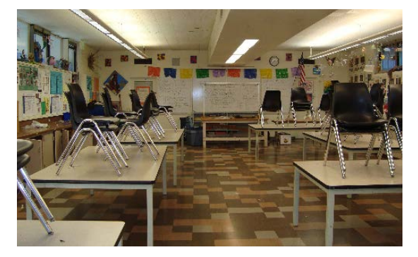
Modernize classrooms not addressed in 2006.

ANAHEIM UNION HIGH SCHOOL DISTRICT Facilities Master Plan