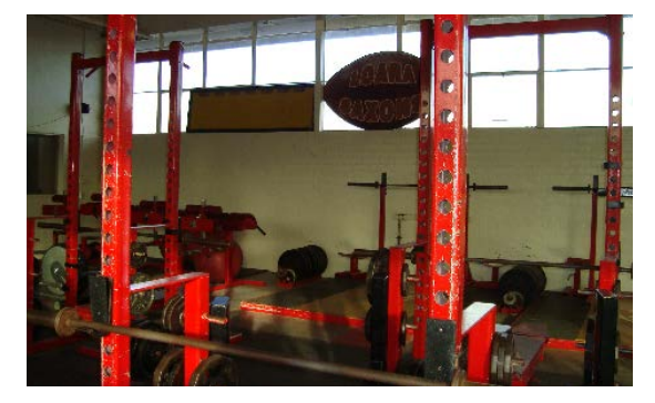
Modernize buildings not addressed in 2006.