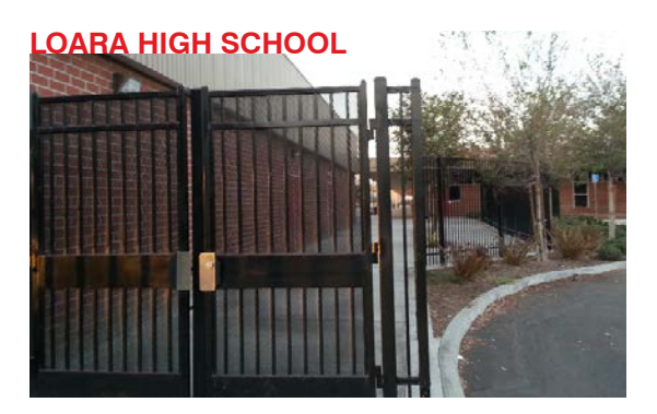
Need additional/improved fencing to combat vandalism.