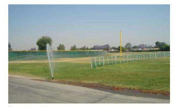
The athletic fields need new irrigation system.